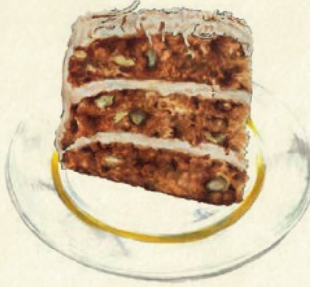
CARROT CAKE, 12 ♣