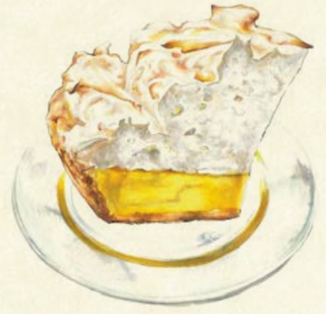
LEMON MERINGUE PIE, 12