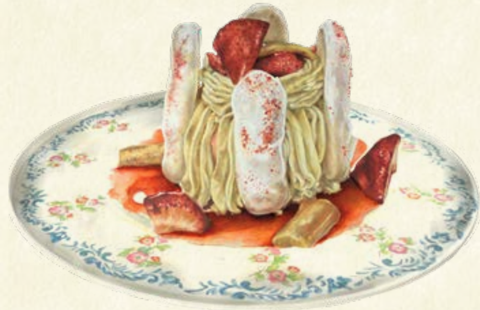
STRAWBERRY VACHERIN, 16 ☉