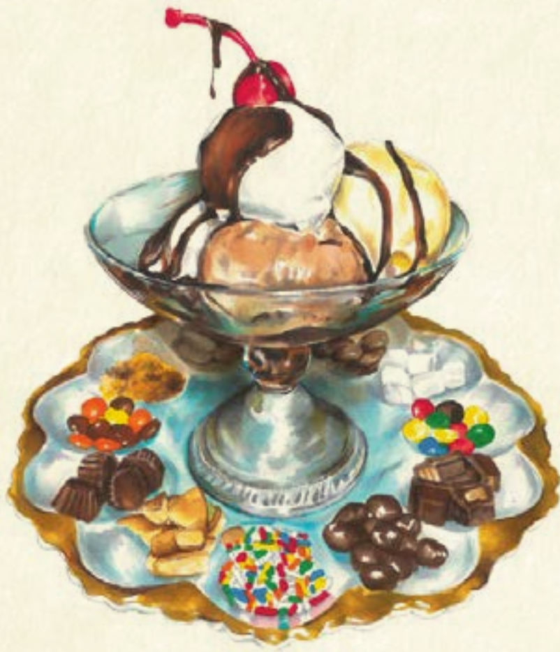
HOT FUDGE SUNDAE ROYALE, 18 ♣☉